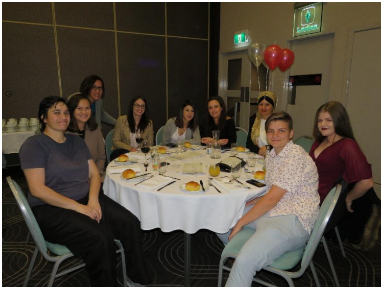
AAL past and present