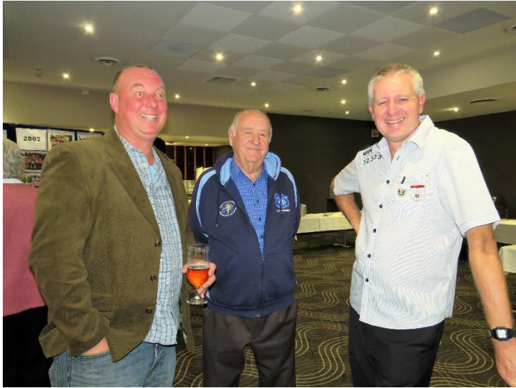
Great to have some 1999 originals and CFA exec to catch up with

http://mccredie.nfshost.com/soccer/historical/Guildford%20McCredie%20Uniting%20Soccer%20Club%2020%20years.pdf