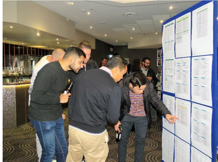
The PL boys read of past glories