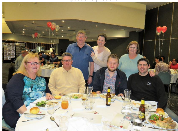
Life members and families that have given so much to our club