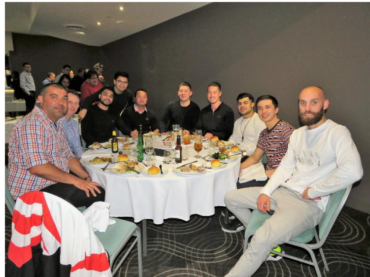
PL past and present