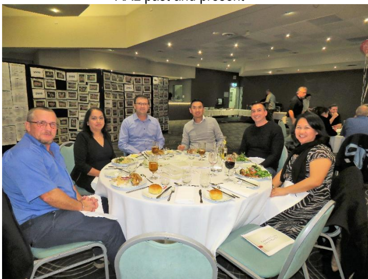
Some of the junior team representatives